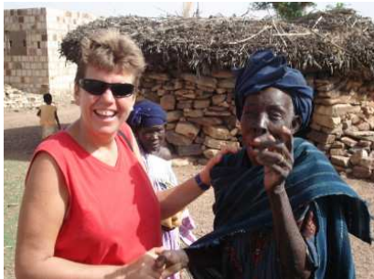
Meeting people in the Dogon

As you can see on the pictures below I have had a very blessed and varied summer, hosting visitors from my home congregation as well as a trainee from the Netherlands for about one month. I have been encouraged and got my mind sharpened again ! Thank you visitors and thank You dear Lord !