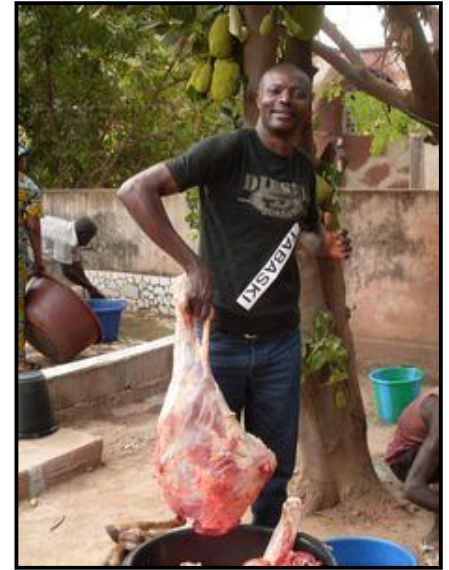
A few pictures showing the cows we received!!